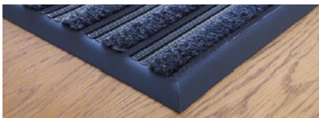
For edges, use PVC edging